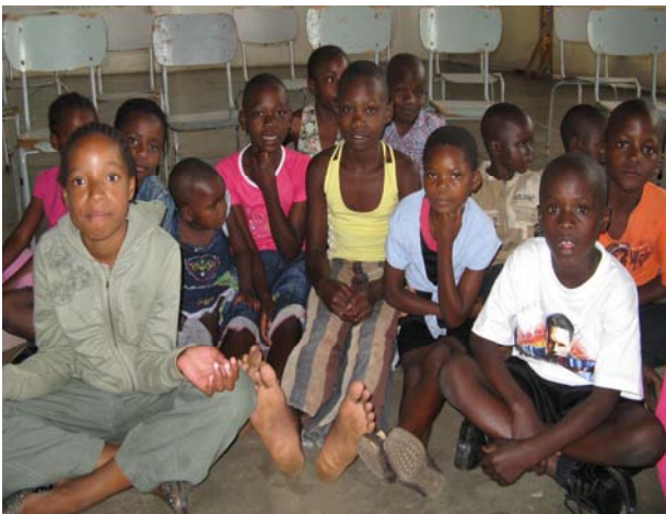
Some of the kids in Zimbabwe

Please pray for the hundreds of pupils and the teachers who heard the gospel during that time that they would become Christians and that the Political situation in Zimbabwe would change positively and not deteriorate further.