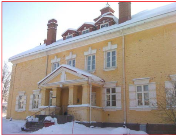
FLM Bible College